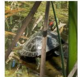
*Red-eared Slider Trachemys scripta