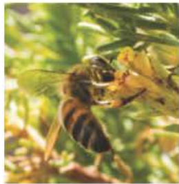
*Western Honey Bee Apis mellifera