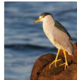
Black-crowned Night-Heron Nycticorax nycticorax