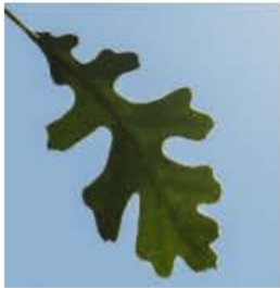
Valley Oak Quercus lobata