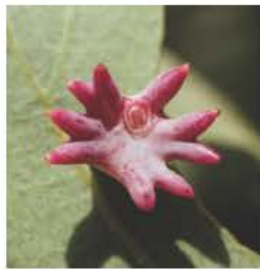
Spined Turban G. W. Cynips douglasii