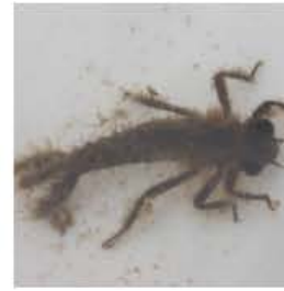
Dancer Damselfly Argia sp.