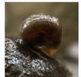
Marsh Ramshorn Planorbella trivolvis