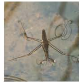
Common Water Strider Aquarius remigis