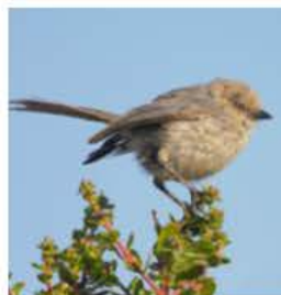
Bushtit Psaltriparus minimus