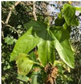
Western sycamore Platanus racemosa