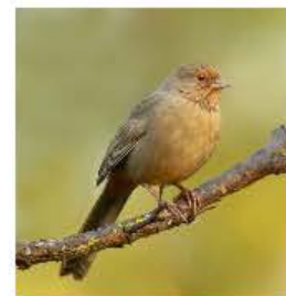
California Towhee Melospiza crissalis