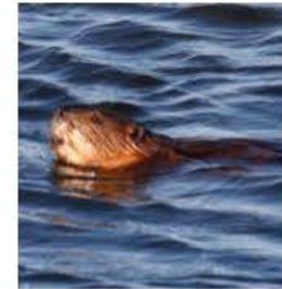
American Beaver Castor canadensis