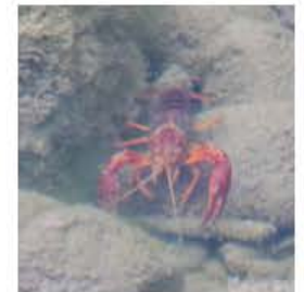
*Red Swamp Crayfish Procambarus clarkii