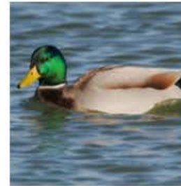
Mallard Anas platyrhynchos