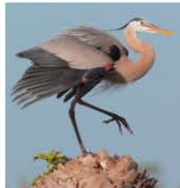
Great Blue Heron Ardea herodias