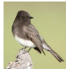
Black Phoebe Sayornis nigricans