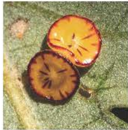
Disc Gall Wasp Andricus parmula