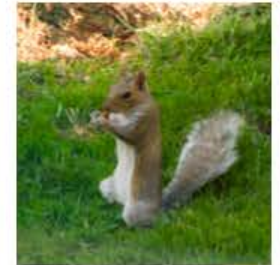
*Eastern Gray Squirrel Sciurus carolinensis