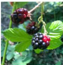
*Armenian Blackberry Rubus armeniacus