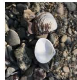
*Asian Clam Corbicula fluminea