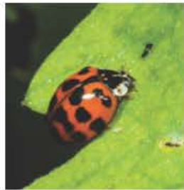
*Asian Lady Beetle Harmonia axyridis