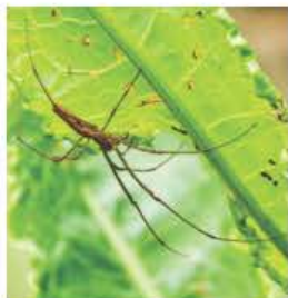
Long-jawed Orbweaver Tetragnatha sp.