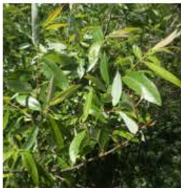
Willow Salix sp.