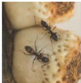
*Argentine Ant Linepithema humile