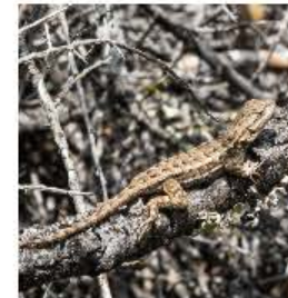
Western Fence Lizard Sceloporus occidentalis