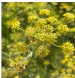
*Fennel Foeniculum vulgare