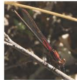
American Rubyspot Hetaerina americana