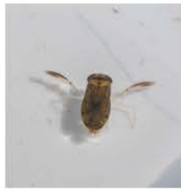
Water Boatmen Corixidae