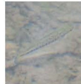
*Largemouth Bass Micropterus