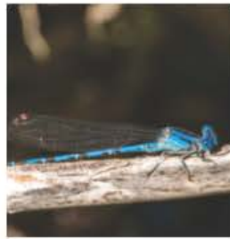
Vivid Dancer Argia vivida