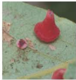
Red Cone Gall Wasp Andricus kingi