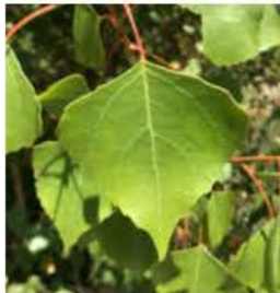
Fremont Cottonwood Populus fremontii