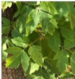
Boxelder Maple Acer negundo