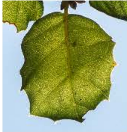
Coast Live Oak Quercus agrifolia