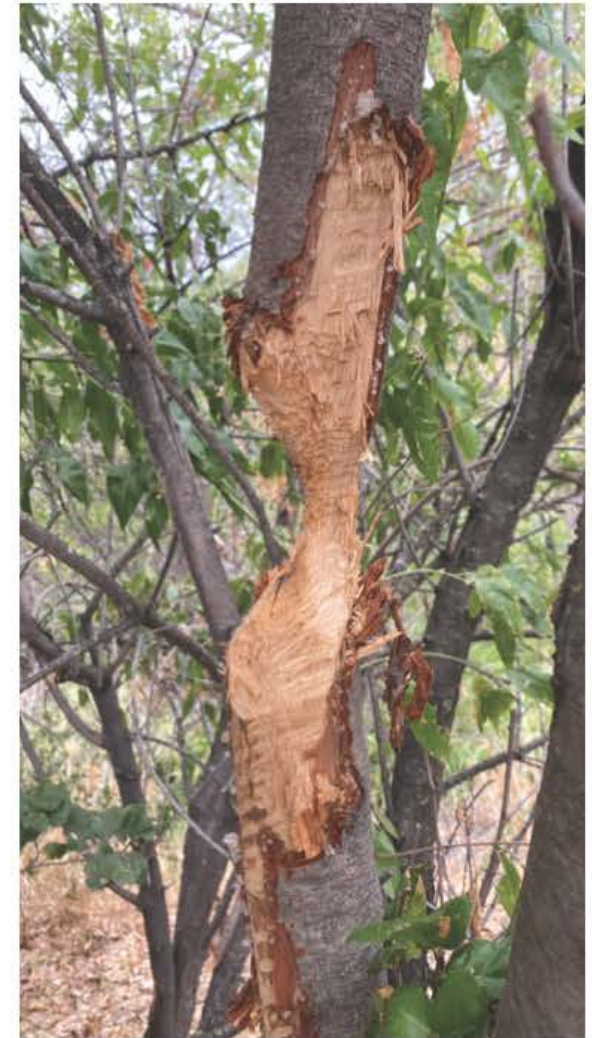
American Beaver Castor canadensis