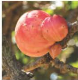
California Gall Wasp A. quercuscalifornicus