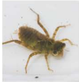
Skimmer Dragonfly Libellulidae