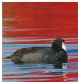
American Coot Fulica americana